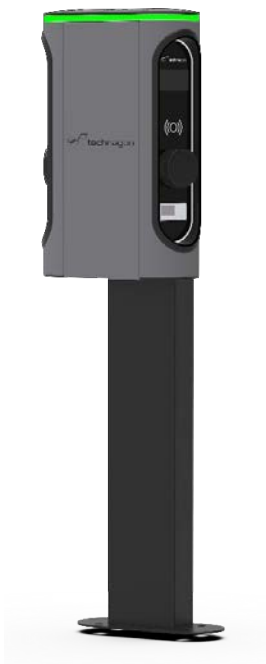
Stele with one mounted W40