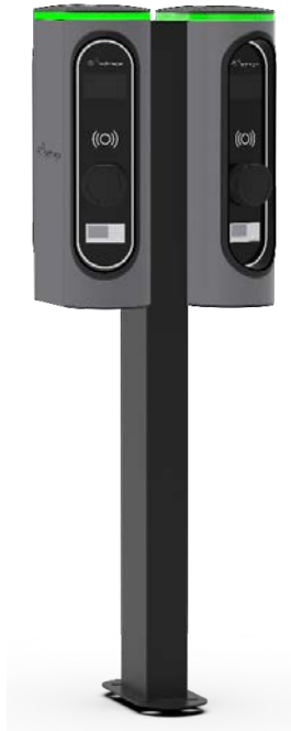
Stele with two mounted W40